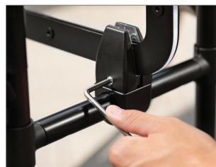
Interlocking mount adapts easily