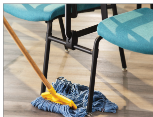
Elevated for quick cleaning