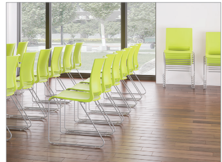
Stackable wire rod and 4-leg bases