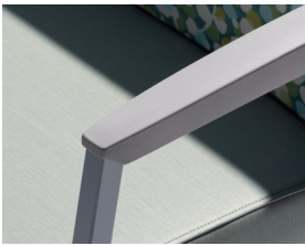
Glass-filled nylon arm cap