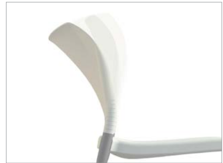
Innovative flex-back disc system